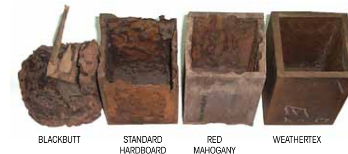
SAMPLES REMOVED FROM TERMITE TEST AFTER 2.5 YEARS EXPOSURE

Weathertex should not be used in contact with the ground. Our fixing instructions state that there should be at least 150mm clearance between the bottom edge of Weathertex Weatherboards and paved surfaces which are exposed to the weather and at least 225mm clearance to unprotected ground.