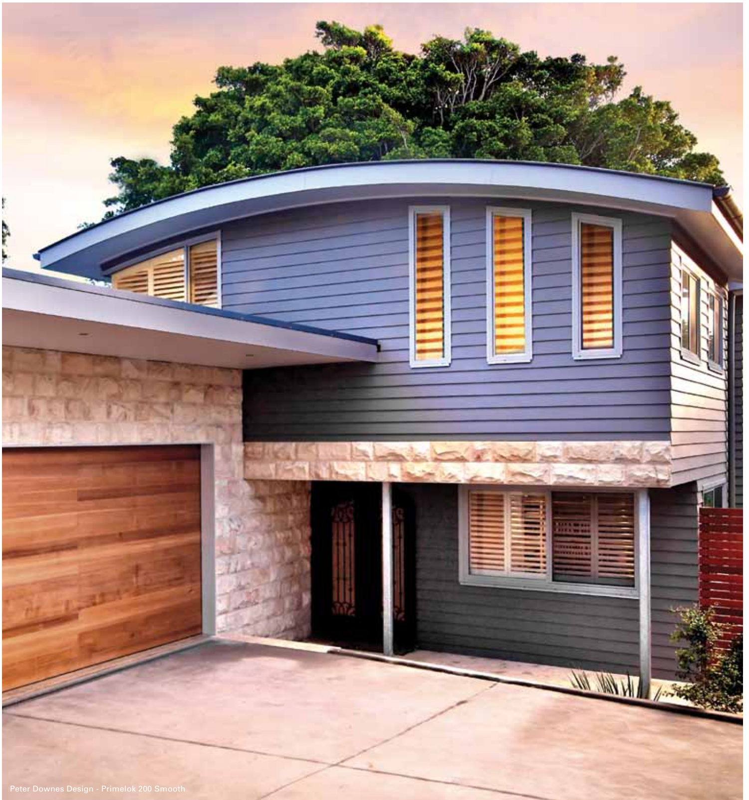
Peter Downes Design - Primelok 200 Smooth